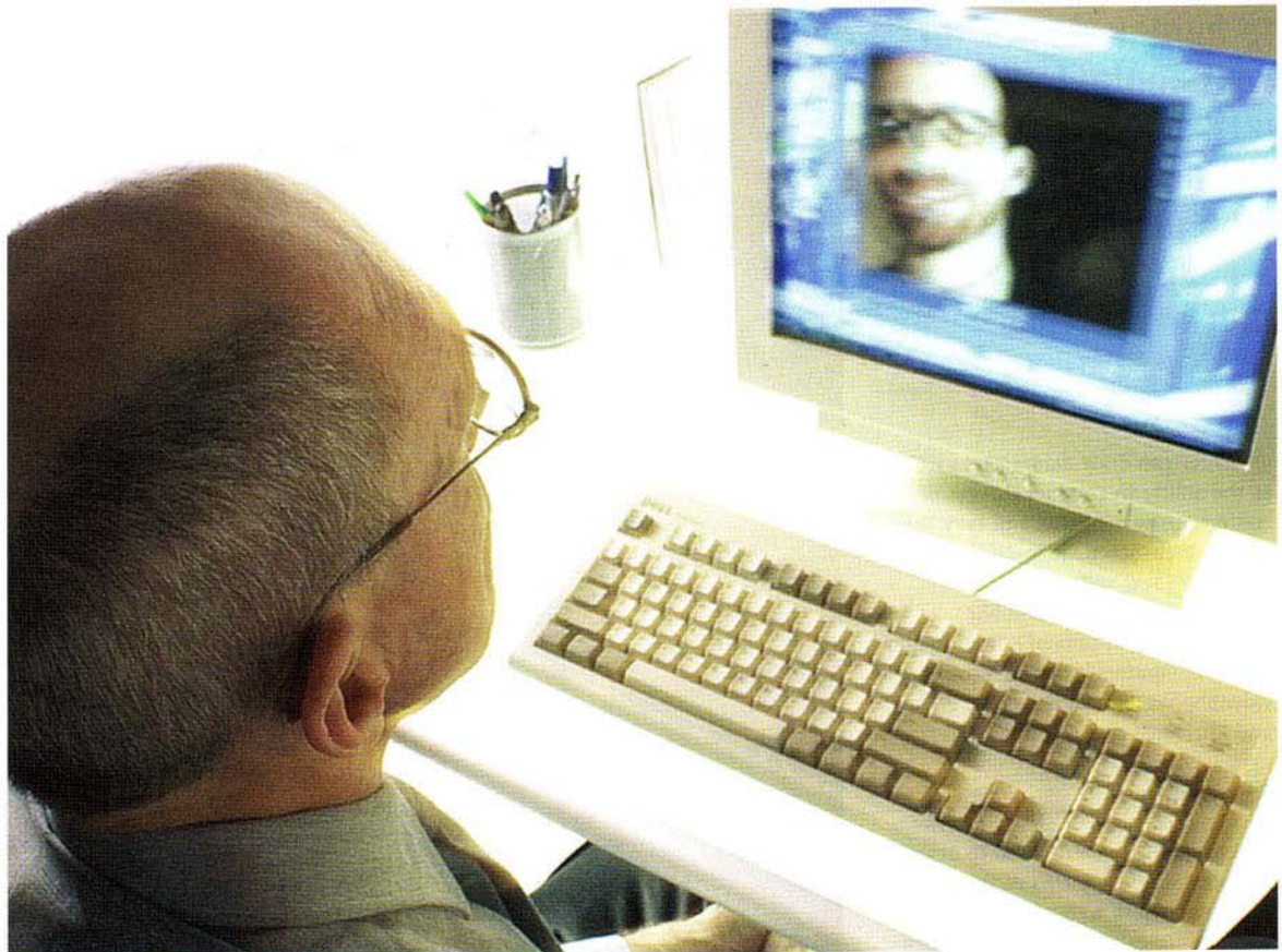
Advantages of video-conferencing include increased efficiency and shorter meeting times.